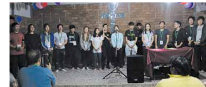
Youth Team sharing a song item

This trip also opened me up to the task of sharing the Gospel with my family, immediate and extended. During house visitations, many team members shared their experiences converting family members, and I realised how seriously they and their families took this task. It was almost shocking to see how ardently they went about this duty, and it's something I took to heart and remember very clearly about this missions trip.