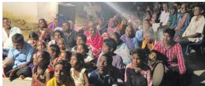
Village night rally

For me, making it to India was a miracle! On the first day we ministered at Christ Church, Oddupalle. It is a home Church, for the Dalit people, the outcaste in the Indian society. I had the opportunity to pray for a 50-year old lady who was on crutches and could not walk well. She was sitting on a chair and when I laid my hand and prayed for her, nothing happened. I was disappointed initially and I asked the Lord why she was not healed. I have heard of stories of instant healing like those at ‘healing crusades’. I learnt later that this lady had been bedridden for a few years! She been there in church regularly and sitting upright for her is already a miracle from Jesus!