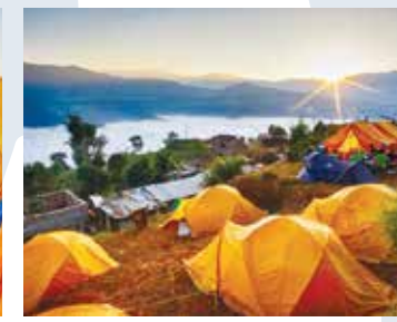
Nepal Missions Team 2017