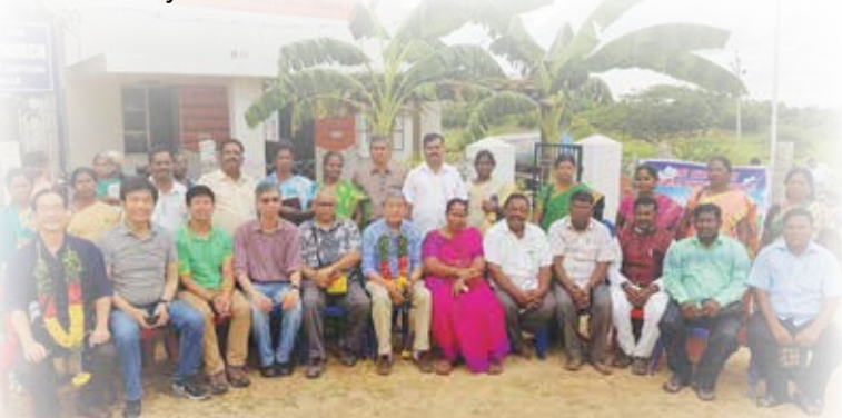
BRMC Missions Team with TLT Church Planters

This mission trip was a life-changing event for me. I dare say that I have fallen in love with the people of India – especially the children! Will I go to India again? Yes indeed! And I am going again in 2018! Come and join us for a holy adventure to India this year!