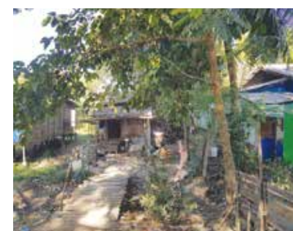
Needy villagers live around Boxer-Shalom Gospel Centre and Bethel Gospel Centre

I felt that God was using my involvement in the Missions work to show me the meaning of life, learning from different countries about the people, culture, circumstances in life, the limitations, challenges they face each day... It reminded me that in spite of the harsh condition and hardship of the fewer opportunities open to them, they can be happy. One of my favourite bible verses is