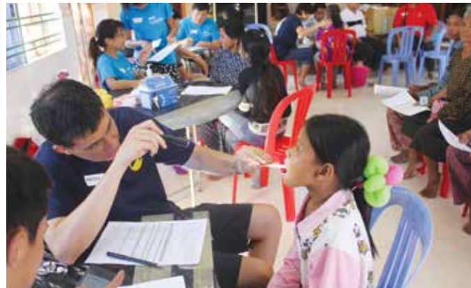
Medical Camp at ALMC

unsaved, as well as those serving the local churches. My takeaway verse for the trip is Romans 10:14 – "How, then, can they call on the one they have not believed in? And how can they believe in the one of whom they have not heard? And how can they hear without someone preaching to them?" May God help us to share the gospel in and out of season!