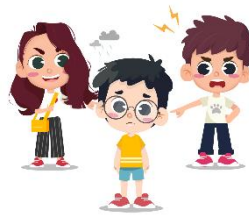
Bullying a friend

http://www.clker.com/cliparts/4/d/0/9/1516507551944315051free-clipart-children-helping-each-other.med.png https://www.kindpng.com/imgv/iiTIRT_kindness-clipart-kind-student-children-showing-kindness-clip/ https://pngtree.com/element/download?id=NTQ3NzQzNw==&type=1&time=1684894703&token=ZmMzYjIzNTk4ODRIYjIzYWM5ZjY3MWFmZGQxNWEyZjk=