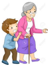
Helping an elderly

How can you show love to others? Circle the loving actions. Write or draw 2 ways of showing love to others.